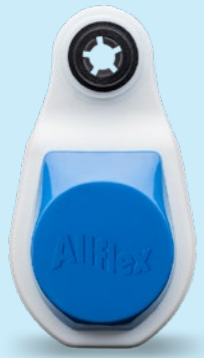
The new ear tag