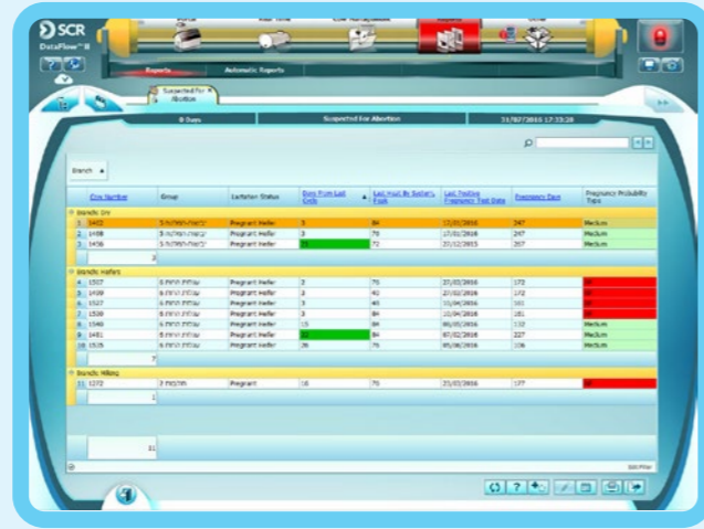
Suspected for Abortion