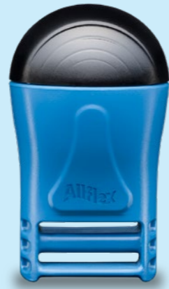
Our award-winning neck tag