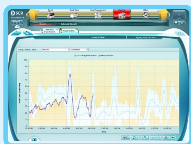
Group Routine Graph