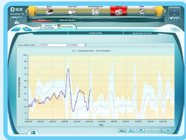
Group Routine Application – Ruminant Graph