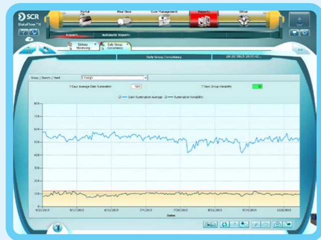
Group Consistency Graph