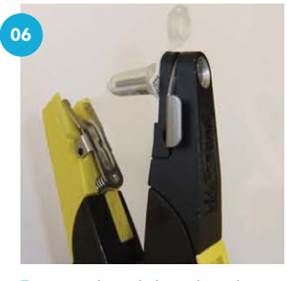
To remove the sealed sampling tube, simply depress the spring loaded metal clip on the side of the top jaw of the tag applicator and remove the sampling tube.