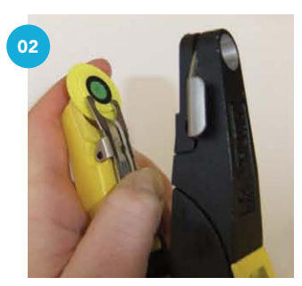
Depress the spring loaded metal clip on the bottom jaw of the tag applicator and place the female part of the tag into the applicator.