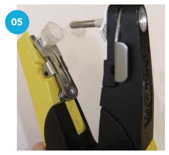
The needle will be retained in the top jaw of the applicator. The tissue sample should be visible in the end of the needle. Place the see-through sampling tube (check number matches tag number) in the bottom jaw of the tag applicator and shut the applicator to seal the sampling needle inside the sampling tube.