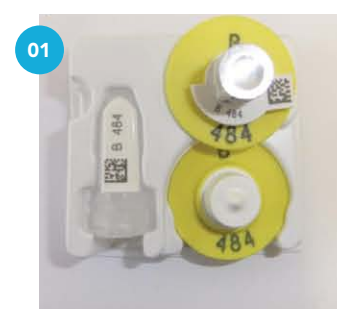
The tag will come packed on a carrier with 4 pieces each labelled with a matching official or management number. Male and female sections of the tag, needle and sample tube. Check all 4 match.

Please ensure that the animal is suitably restrained before application.