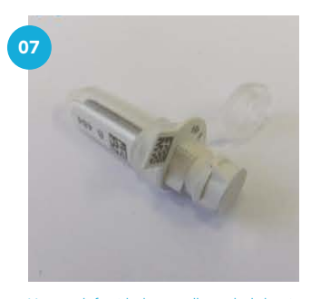
You are left with the needle sealed shut in the sampling tube ready to be sent away for testing. Dispatch ASAP for testing to the laboratory using the returns form and envelopes we supply.