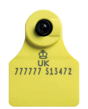
EiD Senior Management Print on Flag