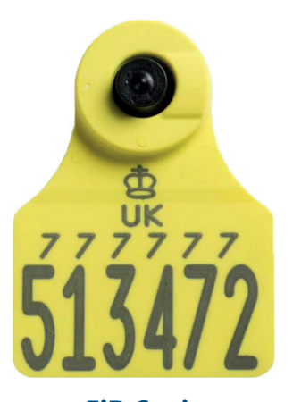
EiD Senior Standard Print