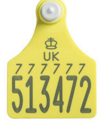
Ultra TST Senior Large