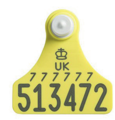
Ultra TST Junior Medium