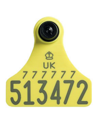
Ultra Junior Medium Part Code: