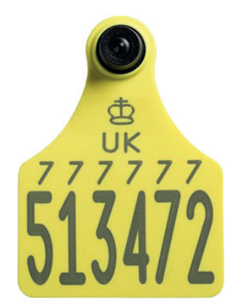
Ultra Senior Large Part Code: