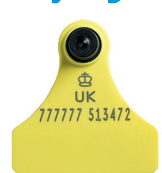
Ultra Junior Management Medium