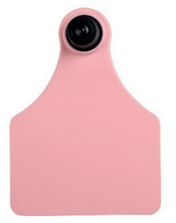
Ultra Senior Large Management