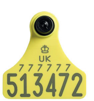
Ultra Junior Medium Part Code: