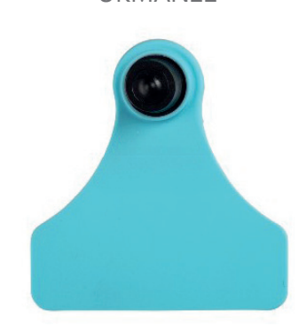
Ultra Junior Medium