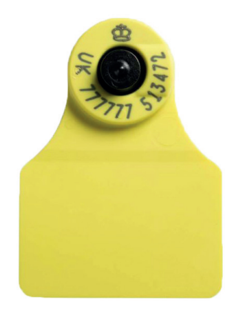
EiD Senior Standard Print on Button