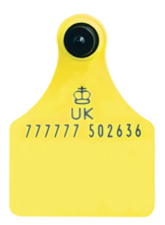
Ultra Senior Management Large