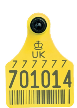
Ultra Senior Barcoded Large