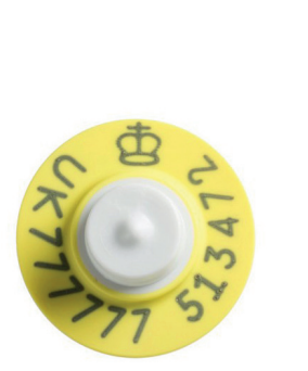
Ultra TST Button Small