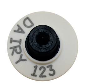
Ultra Small Management Button

which can be read with an EiD stick reader. Using the EiD chip in conjunction with a stick reader and a weigh indicator can help improve monitoring and