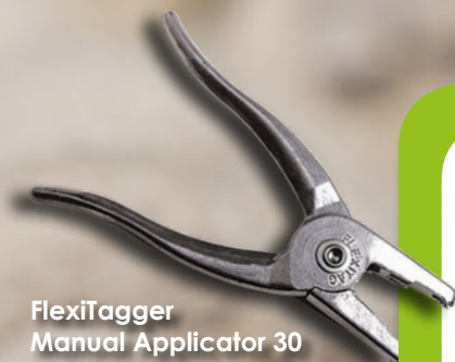
FlexiTagger Manual Applicator 30