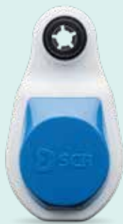
The new ear tag