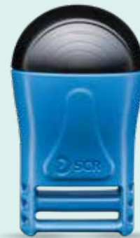
Our award-winning neck tag