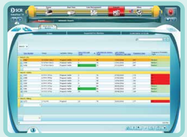
Suspected for abortion