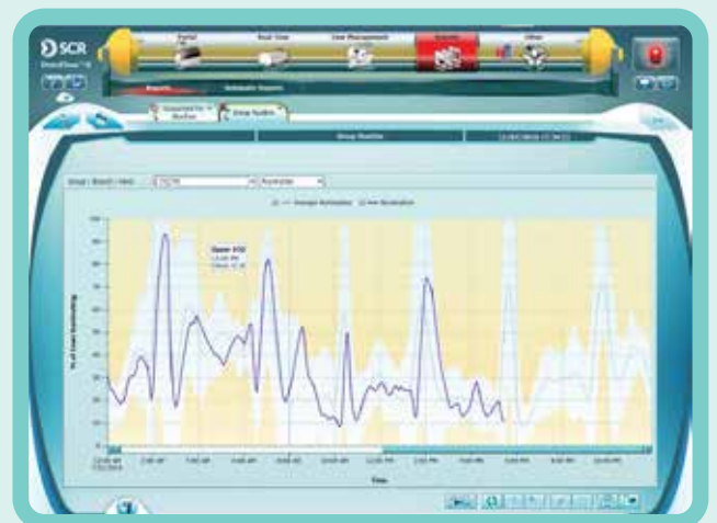
Group Routine Graph