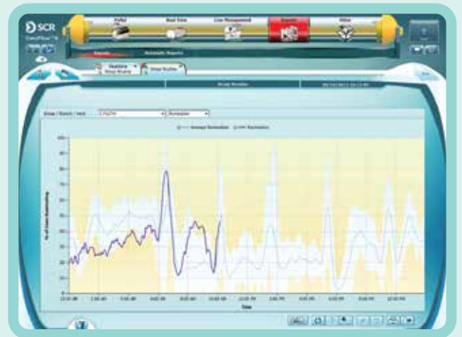
Group Routine Application - Rumination Graph