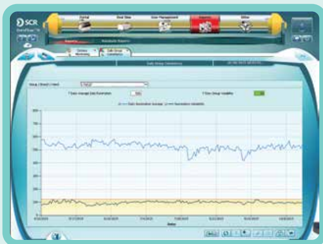
Group Consistency Graph