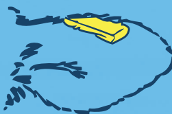
METAL CATTLE/PIG TAG