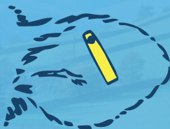
TWO PIECE PLASTIC SHEEP/GOAT TAG

To provide feedback on ear tags please use the Government Ear Tag Feedback forms, available online at the following web addresses: