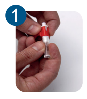
Take an assembled TSU (cutter + connection piece + collection tube)

TSU's should be stored at room temperature prior to use (for a maximum period of 12 months). Care should be taken not to expose the unused product to extremes of heat or cold prior to sampling.