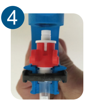
After insertion of the TSU release the spring loaded clips to lock in the tube