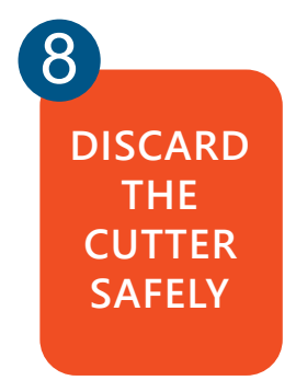
CAUTION: The cutter is very sharp. Mind your fingers!

We recommend samples be taken from the back of the ear rather than the front to minimise the amount of hair which can prevent the TSU from sealing correctly. Sample can be taken from anywhere in the highlighted area, try to find a spot as free from hair as possible and not near a vein. Be sure to check the TSU after sampling to ensure the cap has sealed properly to avoid buffer leaking.