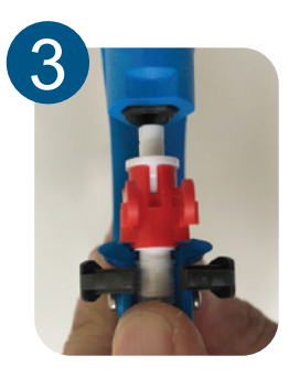
And insert the TSU as shown in the picture