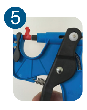
Carefully squeeze the plier handles until the large piston comes to a stop against the red connection piece