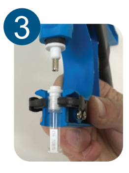
2a. Remove the TSU tube from the pliers by squeezing the two spring loaded clips together, then slide out the tube.