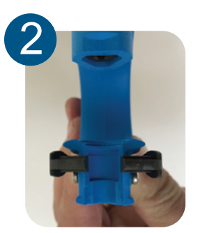
Squeeze the two spring loaded retainer clips together