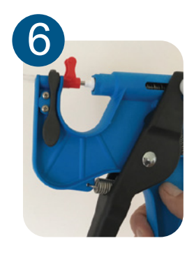
You have now completely grabbed the cutter. After the cutter is inserted into the piston you can release the handles